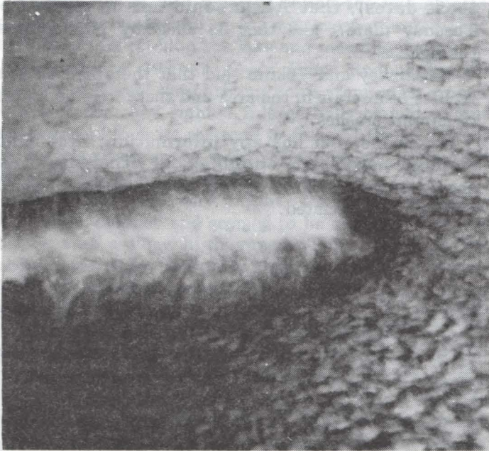
"Cigar-shaped object over Florence, Az.-See Column One.