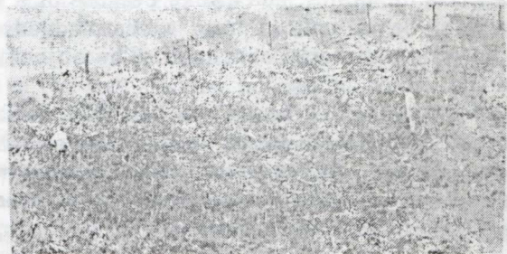
THE WIAMATA VALLEY DECEMBER 20, 1977, AND JANUARY 26, 1978, LANDING SITE.

Two Gisbourne women saw a bright yellowish light at 11:50 p.m. on March 1, 1978, for almost half an hour. The light moved in a circle, then later disappeared into the distance.