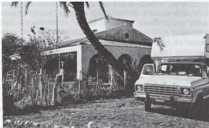
Pedro Romaniuk's camper stands next to the ranch house at the estancia La Aurora. Most of the UFO sightings were from the immediate grounds of the house.

At each location, we saw the same sight—a large circle on the ground where the grass had been burned away, then had grown back much greener than the surrounding grass. In each circle there were three impressions, forming a triangle, as if they had been formed by pod-shaped landing gear. In these impressions no grass had grown back, even though some of them were more than three years old. Each of the impressions was approximately two feet in diameter. The grassy circles varied from about 20 feet to 100 feet in diameter, and the indentations, or pod marks, were spaced farther apart when located in the larger circles. Next to each pod mark was a smaller indentation, varying from two to three inches in diameter. Again, vegetation had not grown back in these smaller indentations regardless of age. Each of these small impressions was located a few inches from the larger pod marks, and always on their outside edge, that is, on the edge facing the outer rim of each grassy circle. In this respect, the impressions at La Aurora seem to be unique. While we had heard about and seen photographs of apparant pod impressions in other parts of the world, we had never seen smaller circular impressions next to them. Romaniuk believes these were formed by "probes"—shafts extended from each pod of a landing gear to test the ground for firmness, ascertaining whether or not it was capable of supporting the weight of a heavy craft before a final landing was completed.