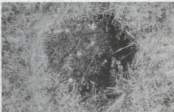
Pod impression showing vegetation beginning to re-establish itself.

What was discovered by the Uruguayan Army after stationing 300 troops at La Aurora for 30 days, however, remains a mystery, for the army has released no information on its activities. Several days before Lois and I arrived at the ranch, the troops, who had with them many heavy vehicles, had pulled out. The operation must have been considered of prime importance, for a general was in charge of it. Pedro Romaniuk and I both knew this and wished to interview him, but we missed him by one day.