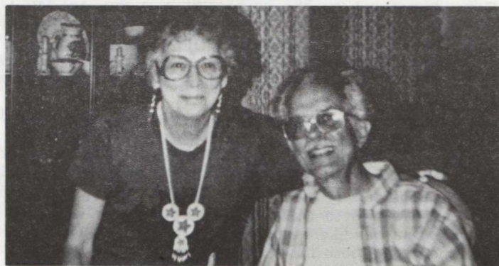
The last photo of the Lorenzens' taken together - fall of 1985.