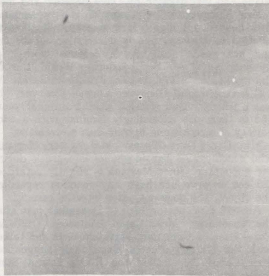
January 22 Sighting - Disc at upper left - Note C-141 at lower right.

silver-orange. At this point surface features - a dome on top and three bell-like protrusions on the bottom were clearly visible. He began to photograph it - obtaining seven fairly clear exposures. It remained some distance from him but not too far away for him to see it clearly. For ten minutes it moved about the sky, changing altitude constantly, turning and almost "sliding" across the sky.