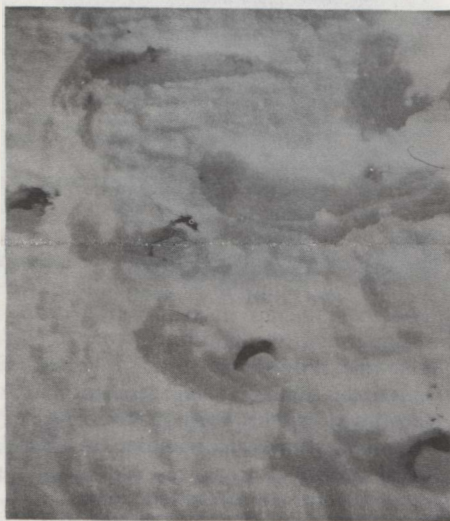
Frederic, Wis. tracks — see below