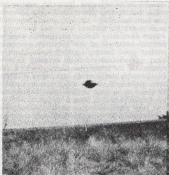
The Passo Fundo Photo

in the back seat for his Kodak Rio Camera which was loaded with color film.