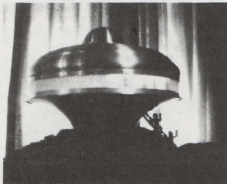
Photo of UFO Model