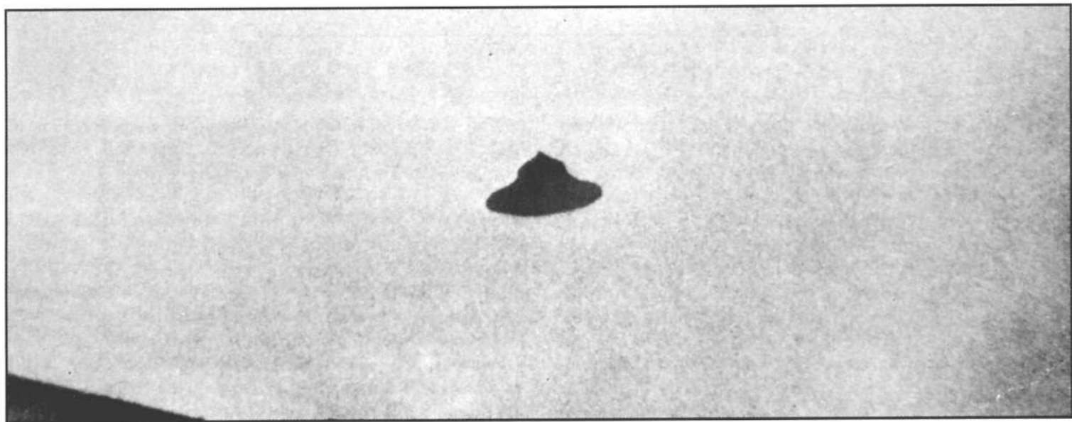
Fig 2. Second photo by Kazuhiko Fujimatsu, October 11, 1974.