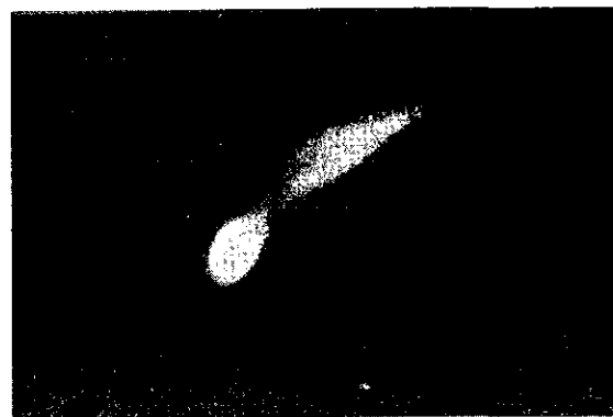
UFO photographed by Astronaut McDivitt

In NASA's annual publication, "Astronautics and Aeronautics," the agency stated that the witness "was unable to identify . . ." the object, and other NASA statements have confirmed that it remained unidentified.