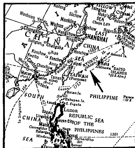
Sighting reportedly occurred in South China Sea, but calculations show probable site is East China Sea (arrow).