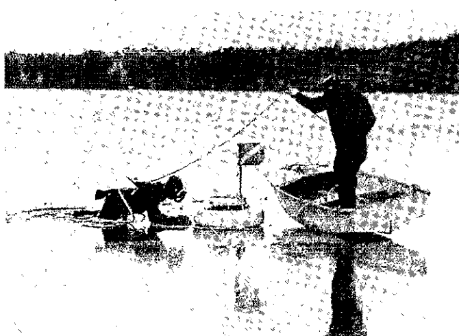
Skin diver enters water of Scargo Lake to search for strange object that reportedly ruptured lake's icy crust.

Among the sightings uncovered is the one on September 8, 1970, reported in last month's "Sighting Advisory." The witness, a farmer and private pilot, was by himself when he first saw the object. After noting that it was apparently stationary, he went into his house and got binoculars, with which he was able to see more detail. He said the object "showed up very sharp and clear," like aluminum, except it was not shiny. He then went to his neighbor's house where he found both the neighbor's family and two of their friends, all of whom came out and watched the object.