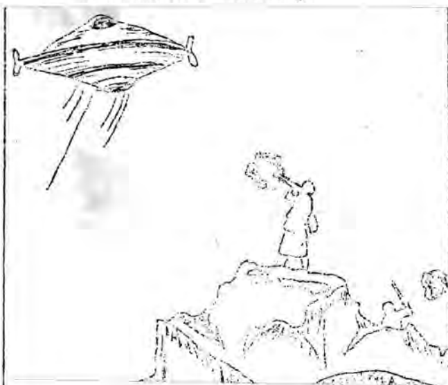
THE BLACK INVASION - Driant, 1896

should have been in the culture's collective imagination. If the books aren't fiction, then what kinds of balloons resembled these oddly shaped devices? Or if not balloons, what were they?