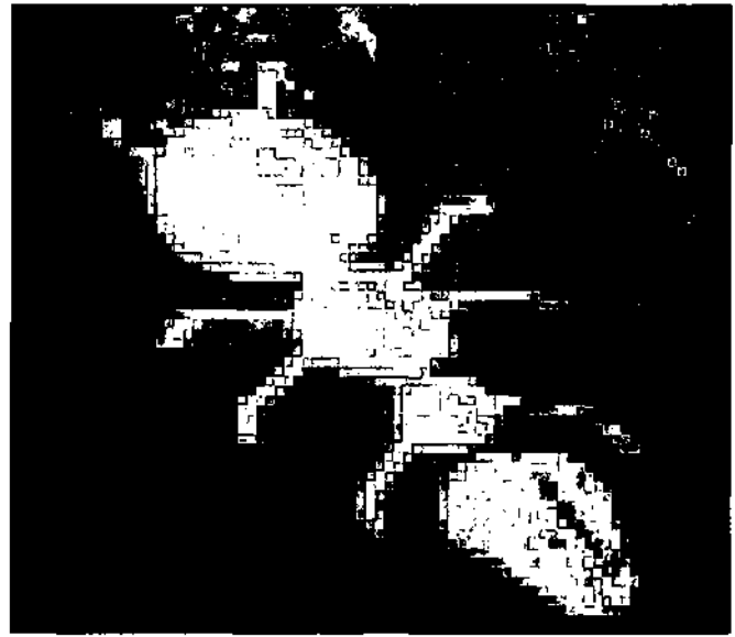
The Henwood Down formation, July 25, 1997, Hampshire, England.

As he implied in his book The Circles Effect and its Mysteries , p. 20, fair weather whirlwinds or ordinary atmospheric vortices could not be responsible. And we of course know that most of the crop-circle formations have occurred at night, and even under damp weather conditions, when summer whirlwind activity is absent or minimal.