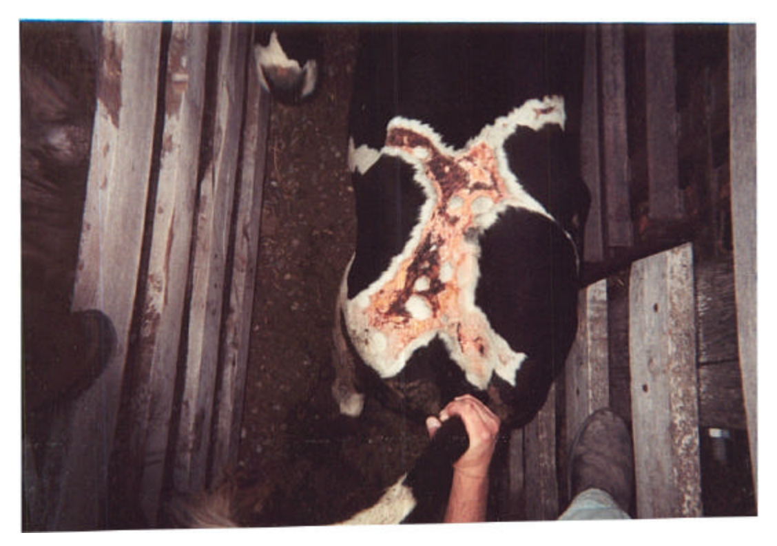
Photo 4. Lesions and scabbing appeared to be distributed according to the pattern of white on the animal's back.

NIDS recommended a blood sample be drawn from the animal to assess hematology and blood chemistry status. However, several days had elapsed between the time the lesions were first noticed and when the blood sample was taken. Thus, it was deemed unlikely that white cell counts or blood chemistry indicators of trauma would not have stabilized by that time. The analyses were conducted in the interests of thoroughness.