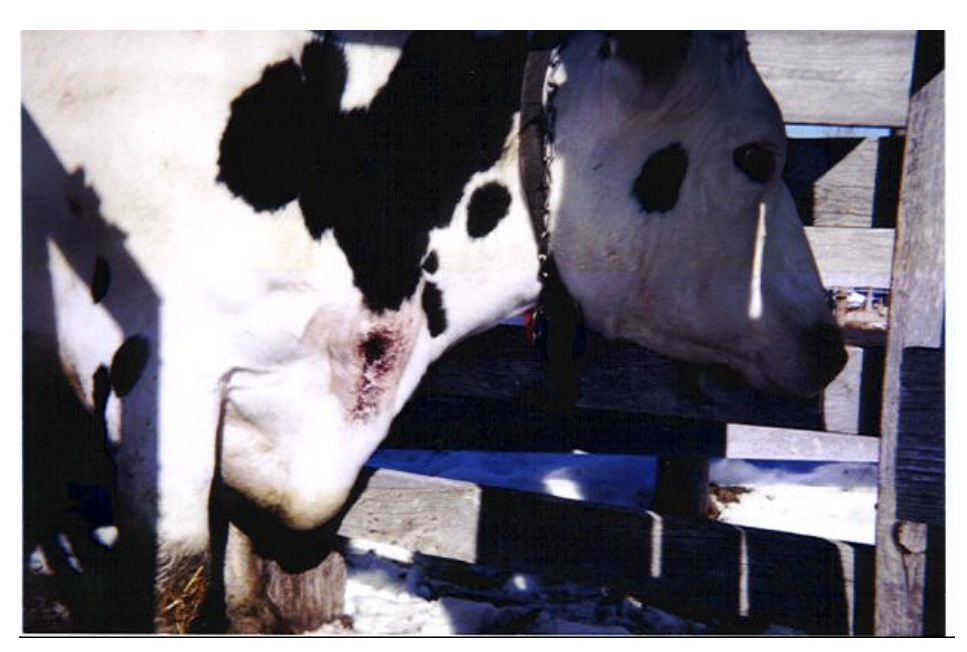
Photo 1. Prominent bloodstain and evidence of a hematoma directly above the animal's right jugular vein.

NIDS received several calls from an individual in Cache County Utah regarding suspicious injuries being inflicted on his herd of dairy animals. The calls spanned the period February–July 2001. The calls involved two separate series of injuries to the witness's animals. Photos 1–3 are detailed in the interview below.